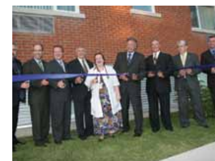
2005 Opening of Lodges in Trois-Rivières and Gatineau Expansion of the Sherbrooke Lodge

Back then, people living with cancer who resided in Northern Quebec did not always have access to lodging services near their treatment centres located in Gatineau. The Foundation first launched a modest eight-bed apartment to meet their needs.