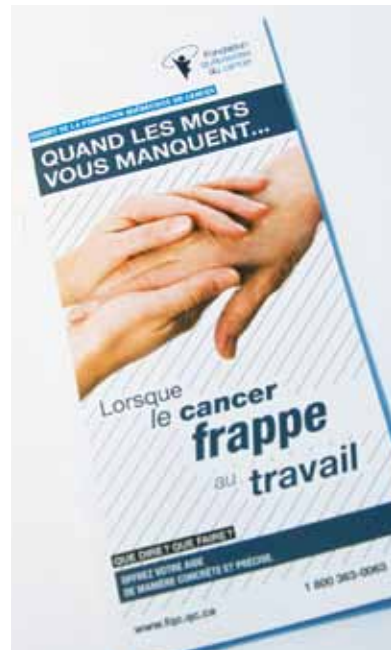
BROCHURE Quand les mots vous manquent

INFO-CANCER Information, support and understanding