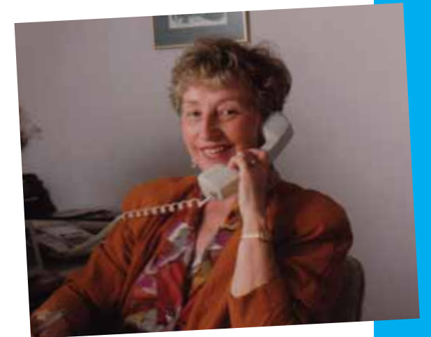
1984 Creation of the Info-Cancer Line

In its early years, the Documentation Centre offered only a dozen or so publications. Today, that number has climbed to some 5,000 titles, making it North America's main French-language library specialized in oncology. Over the past 20 years, the needs for information have changed here in Quebec. In 1989, the medical facets of cancer needed to be demystified. Now, the psychosocial aspects and complementary therapies are the topics attracting the most interest.