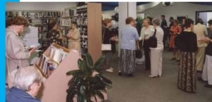
1989 Launch of the Documentation Centre in Quebec City

At the time, there were very few user-friendly, French-language documents available for Quebecers touched by cancer. One of the Foundation's first tasks was to produce a brochure on radiation therapy for distribution in all the radiation centres in Quebec.