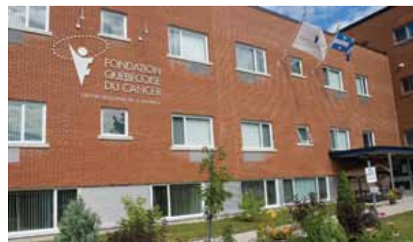
MAURICIE 383 residents 2,672 nights