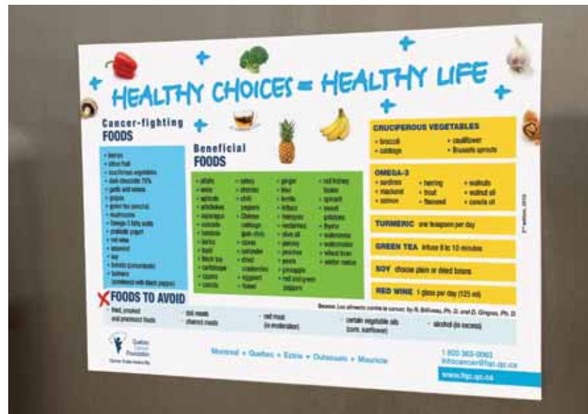
PREVENTION TOOL Healthy Choice = Healthy Life!