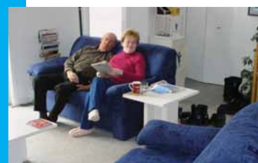
1996 Launch of a pilot accommodation project in Outaouais

Thanks to the exceptional generosity of the Knights of Columbus, who raised $2.5 million, the Foundation was able to open its first two Lodges. The needs were real, since some Quebecers living with cancer had to end their course of treatment for financial reasons.