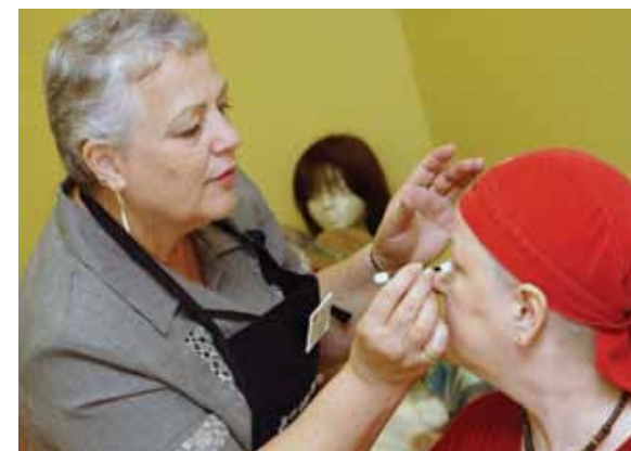
Look Good Feel Better® workshops