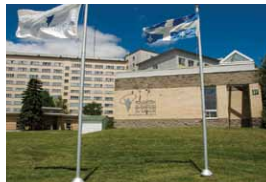
ESTRIE 880 residents 4,833 nights