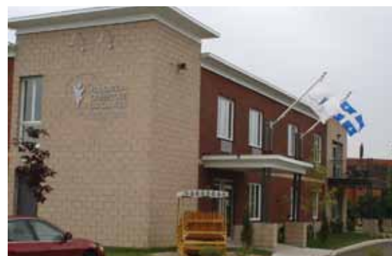
OUTAOUAIS 628 residents 4,340 nights