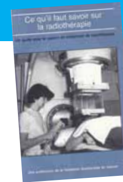
1984 Publication of the first information guide