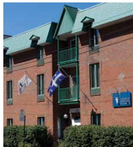
MONTREAL 1,152 residents 8,114 nights

Since 1988, the Foundation Lodges have greeted over 32,000 Quebecers. After two decades of offering help and comfort, our facilities have become more than just places to stay; they are a true haven along the cancer journey. Today, each of our Lodges offers residents a living environment that sets the stage for great victories over disease.